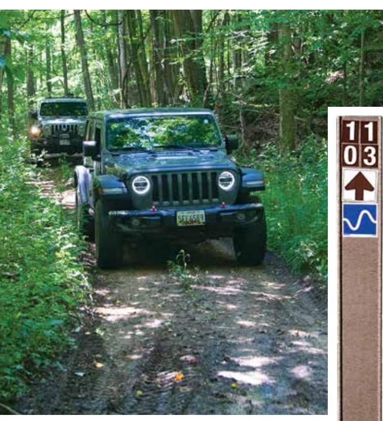
Top: Huckleberry Rocks Area has one of the spacious parking areas. The trails are well marked and color coded according to levels of difficulty — green, blue and black.