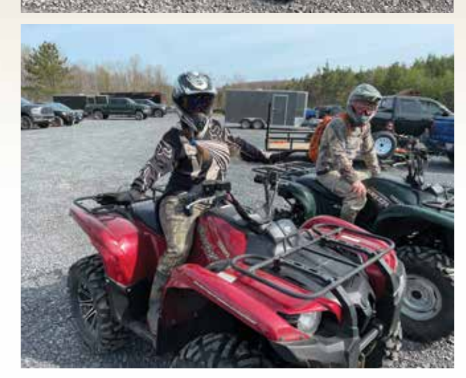
Ample parking for trucks and trailers is available at several locations throughout Wolf Den Run State Park. Riders must bring their own vehicles and register online or in person at the camp office.

Side-by-sides are commonly described as off-road vehicles with a minimum of two seats positioned side-by-side and enclosed within a rolled cage. They are four wheeled vehicles controlled by a steering wheel that is similar to a typical car. Daryl explained that side-by-sides made it easy to get into off-roading experiences and take the family. Hunters also enjoy the benefits of the vehicles because they easily cover rough terrain and carry supplies.