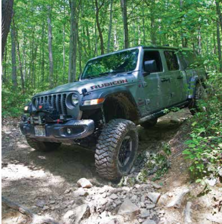
The 50 mile network of trails includes mixed forest and rugged mountainous terrain. A primitive camping area is currently available near the Park Office (no electricity or water hookups available at this time).

Daryl stated that future plans include working with local officials. "We want to continue to commit to additional opportunities in the county and continue economic